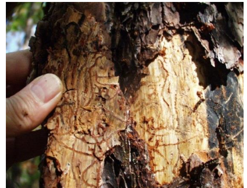
SPB tunnels, or "galleries," under the bark