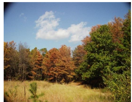
Dead pitch pine trees