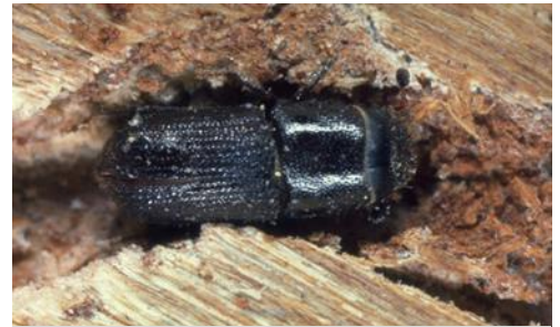
Southern pine beetle